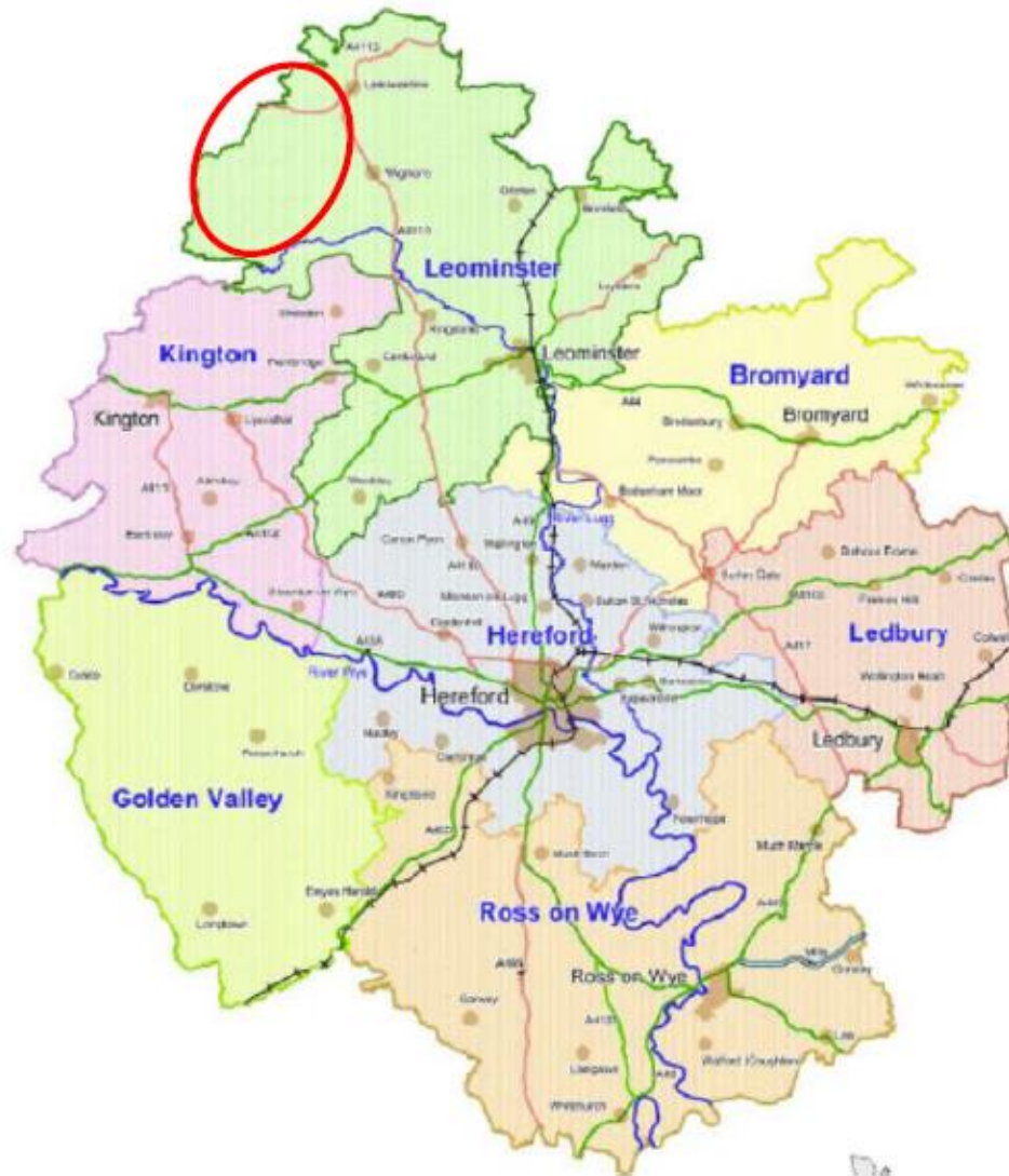
Figure 2 - Location of Border Group Parish within Leominster Housing Market Area.